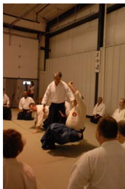
-Ikeda Sensei Seminar 2009

Pre-registration is required. Please contact the Aikido Simboku Dojo at 847-458-9309.